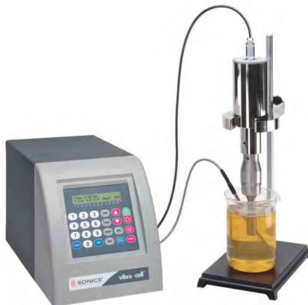
VCX 500 – VCX 750